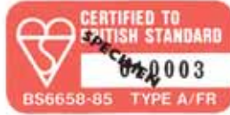
BS 6658-85 Type A/FR